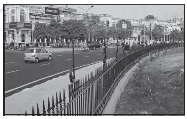
Fig. 2.4: A view of the modern city

The British and other Europeans have developed a number of towns in India. Starting their foothold on coastal locations, they first developed some trading ports such as Surat, Daman, Goa, Pondicherry, etc. The British later consolidated their hold around three principal nodes – Mumbai (Bombay), Chennai (Madras), and Kolkata (Calcutta) – and built them in the British style. Rapidly