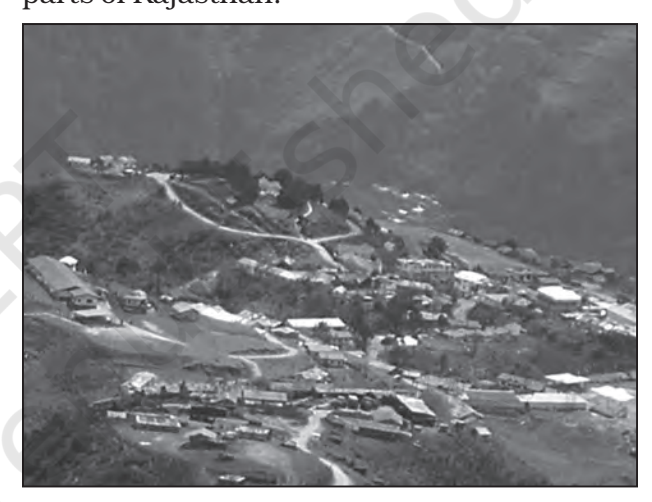
Fig. 2.2 : Semi-clustered settlements

Semi-clustered or fragmented settlements may result from tendency of clustering in a restricted area of dispersed settlement. More often such a pattern may also result from segregation or fragmentation of a large compact village. In this case, one or more sections of the village society choose or is forced to live a little away from the main cluster or village. In such cases, generally, the land-owning and dominant community occupies the central part of the main village, whereas people of lower strata of society and menial workers settle on the outer flanks of the village. Such settlements are widespread in the Gujarat plain and some parts of Rajasthan.