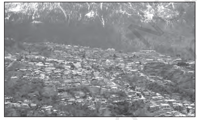
Fig. 2.1: Clustered Settlements in the North-eastern states

The clustered rural settlement is a compact or closely built up area of houses. In this type of village the general living area is distinct and separated from the surrounding farms, barns and pastures. The closely built-up area and its