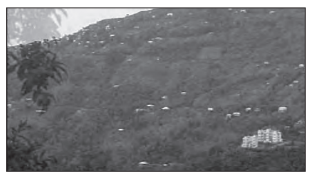
Fig. 2.3: Dispersed settlements in Nagaland

with farms or pasture on the slopes. Extreme dispersion of settlement is often caused by extremely fragmented nature of the terrain and land resource base of habitable areas. Many areas of Meghalaya, Uttarakhand, Himachal Pradesh and Kerala have this type of settlement.